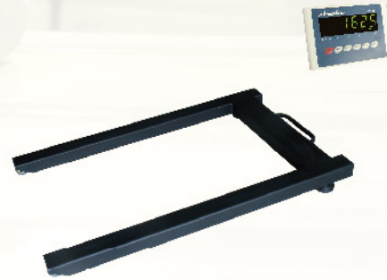
碳钢秤体标配仪表AS131-PL Standard Configuration to Mild Steel Scale body Indicator AS131-PL