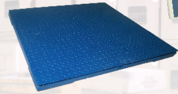
碳钢秤体标配仪表AS131-PL Standard Configuration to Mild Steel Scale body Indicator AS131-PL