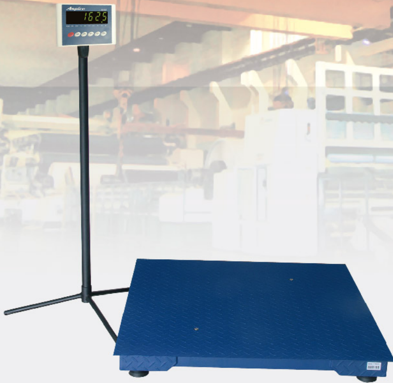
碳钢秤体标配仪表AS131-PL Standard Configuration to Mild Steel Scale body Indicator AS131-PL