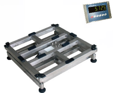
不锈钢秤体标配仪表AS131-SS Standard Configuration to Stainless Steel Scale body Indicator AS131-SS